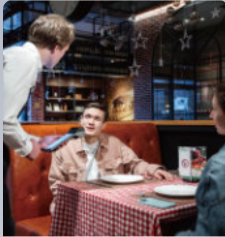
Mobile Ordering Excellence