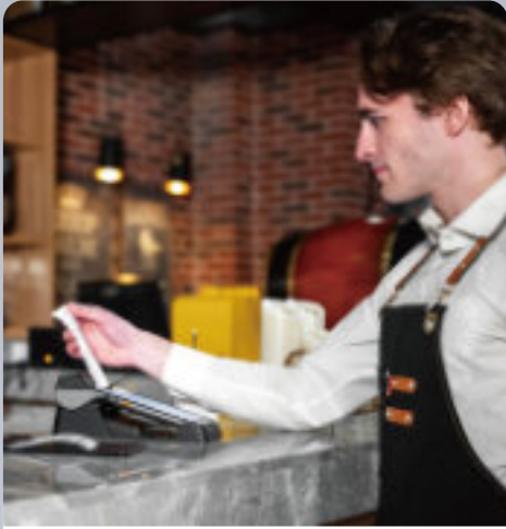
Delivery Order Management