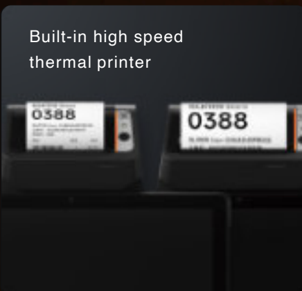
Built-in high speed thermal printer